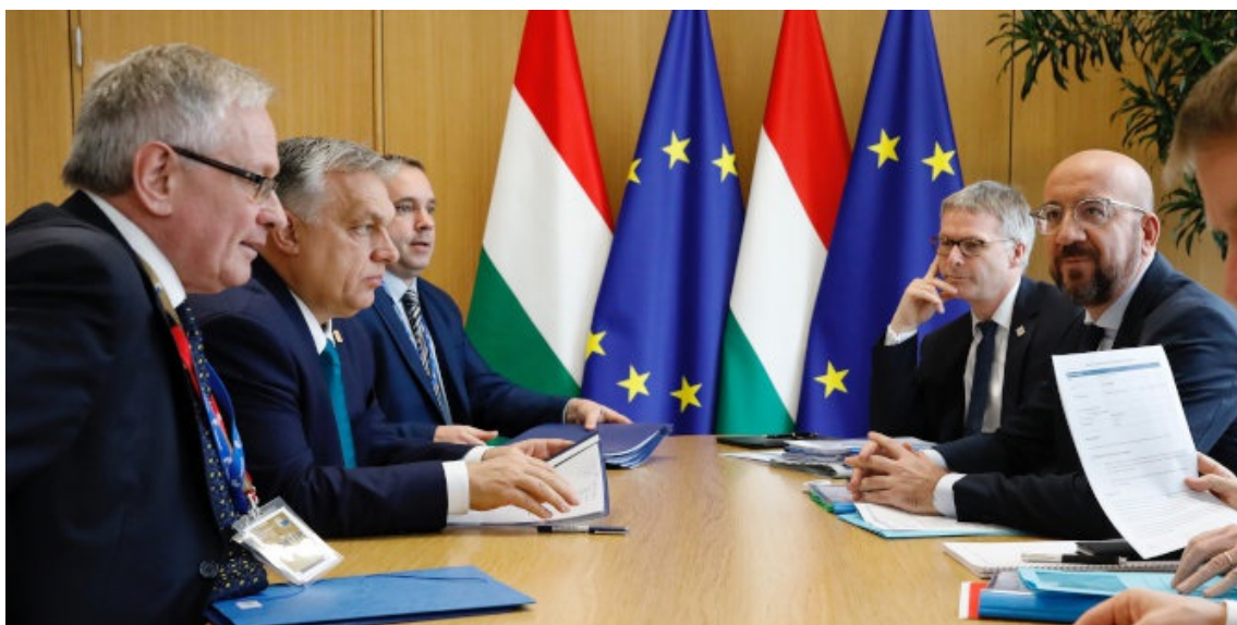
Viktor Orbán, Hungarian Prime Minister, meeting with Charles Michel, President of the European Council, in February 2020

Carothers' famous – and controversial – essay was in places overstated. In hindsight, it reads as a prescient warning not just of the prevalence of ‘hybrid regimes’ manipulating democratic institutions for authoritarian ends in the post-Soviet space and Africa, but also of the weakness of many supposedly consolidated democracies in Central and Eastern Europe. Many bore more than a passing resemblance to Carothers' scenario of “feckless pluralism”. However, more importantly for the current debate on Central and Eastern European democracies, it serves as a warning that we should not fall into a possible “backsliding paradigm” with flawed assumptions which are a mirror image of the “transition paradigm”.