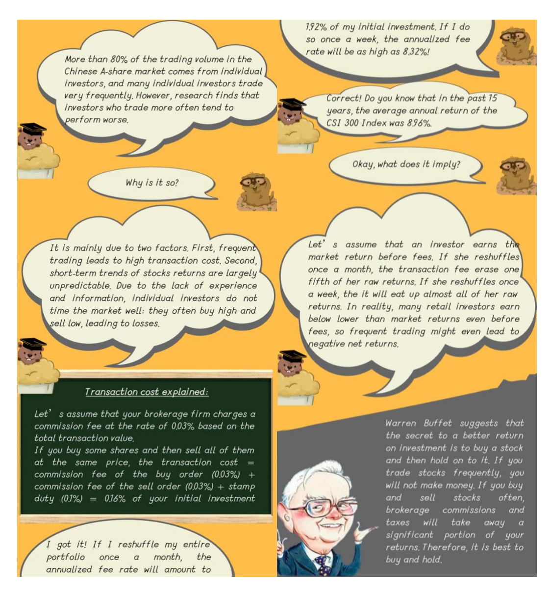
Figure A3 The "Nudge" to Reduce Trading Due to Transaction Costs

We study the effect of this "nudge" in a difference-in-difference framework; Table A19 reports the results. Column (1) shows that the interaction term is small and insignificant, suggesting that the treatment and control groups exhibit similar turnover rates one month after the survey. We repeat this exercise in columns (2) and (3) by expanding the window to three months and six months before and after the survey, and the interaction term remains insignificant. Overall, these results suggest that the nudge had no effect on reducing trading. One might argue that the "nudge" was not sufficiently strong and the treated group may not have read the article carefully. However,