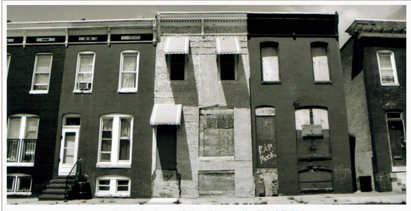
Abandoned row houses in Baltimore

In 1970, declaring that the federal government had established a "white noose" around ghettos in Baltimore and other cities, HUD Secretary George Romney proposed denying federal funds for sewers, water projects, parkland, or redevelopment to all-white suburbs that resisted integration by maintaining exclusionary zoning ordinances (that prohibited multi-unit construction) or by refusing to accept subsidized moderate-income or public low-income housing. In the case of Baltimore County, he withheld a sewer grant that had previously been committed, because of the county's policies of residential segregation. It was a very controversial move, but Romney got support from Vice President Spiro Agnew, who had been frustrated by unreasonable suburban resistance to integration and mixed income developments when he had been the Baltimore County Executive and Governor of Maryland. In a 1970 speech to the National Alliance of Businessmen, Agnew attacked attempts to solve the country's racial problems by pouring money into the inner city as had been done in the Johnson administration. Agnew said that he flatly rejected the assumption that "because the primary problems of race and poverty are found in the ghettos of urban America, the solutions to these problems must also be found there... Resources needed to solve the urban poverty problem—land, money, and jobs—exist in substantial supply in suburban areas, but are not being sufficiently utilized in solving inner-city problems."