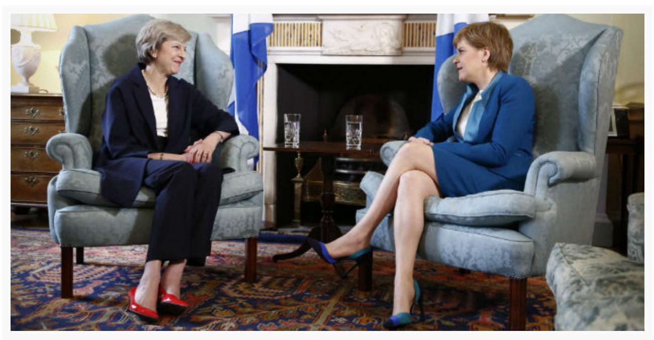
Nicola Sturgeon hosts Theresa May at Bute House in Edinburgh, July 2016.

The situation in Scotland is quite different. The Scotland Act 1998 provides that the Scotlish Parliament cannot legislate on issues related to the Constitution of which 'the Union of the Kingdoms of Scotland and England'. This means that the Scotlish Parliament does not have a right to unilaterally organise an independence referendum. The 2014 independence referendum was lawfully organised only because the 'two governments of Scotland' reached a political agreement (the Edinburgh Agreement ). According to it, Cameron and Salmond agreed to amend the text of Scotland Act 1998 to the effect that a new section was introduced. This new section explicitly conferred the power to Holyrood to organise an independence referendum by 31 December 2014.