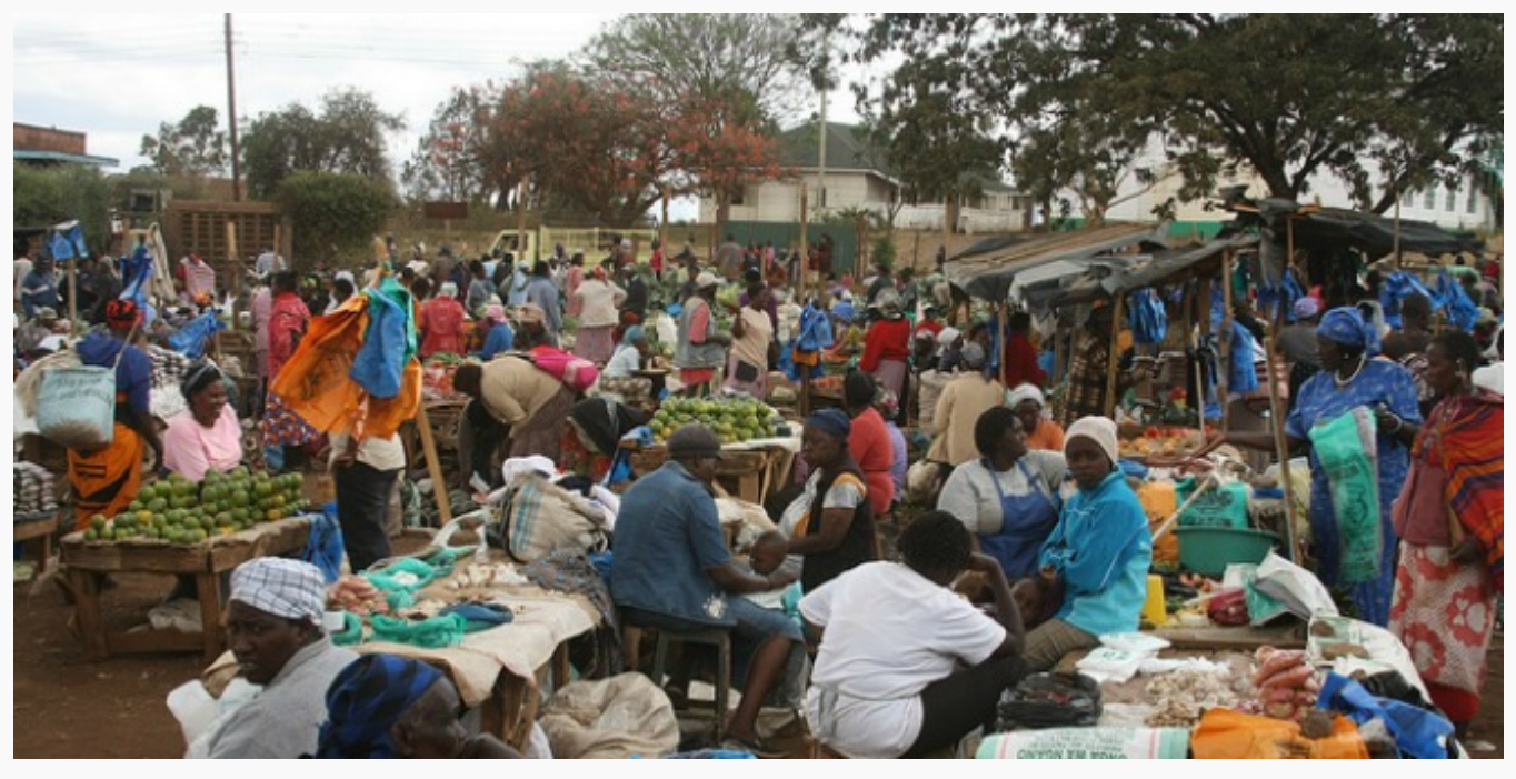
Loitokitok market, Kenya.

in illicit or informal economies, which in times of stability are often not traditionally recognised as belonging or 'having a place' at all.