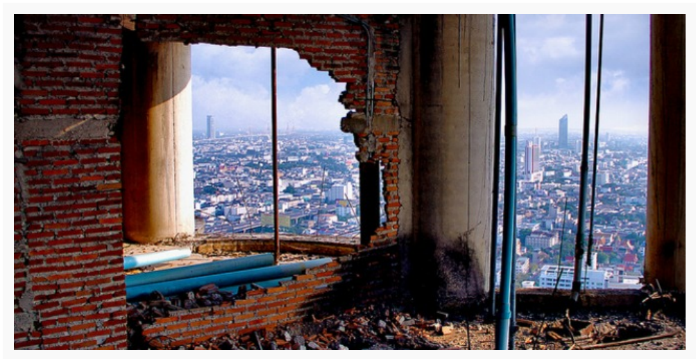
47th floor in the abandoned skyscraper Sathorn Unique Building, Bangkok.

One of several literary references (opening up one of the most striking ideas contained within this book) is the reference made to Victor Hugo's Notre-Dame, which explains how an archdeacon: