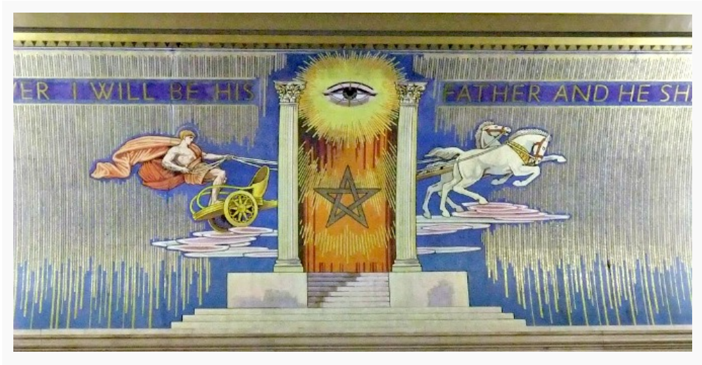
Inside the Freemasons' Hall, which houses the headquarters of the United Grand Lodge of England.