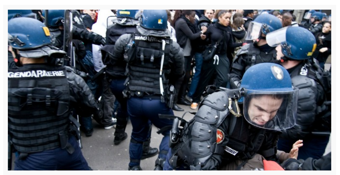
Police at a demonstration in Paris, 2008.

manner, but oftentimes not so – and the racist language that went hand-in-hand, he argues, with discriminatory practices. It is not that such profiling and unequal treatment isn't to be found in England – far from it – rather that there is a sensitivity around race and ethnicity, certainly as far as the use of language is concerned, which had certainly not permeated French policing by the time of Fassin's research. Or, at least, officers seemed less concerned to hide it. In addition to an underlying racism, the culture of the anti-crime squad emphasized their toughness and potential for violence, as well as playing on the considerable autonomy they enjoyed with a consequent freedom to bend the rules. It was perhaps of little surprise therefore that Vic Mackey – the corrupt cop at the heart of the US TV series The Shield – was something of an idol to many in the squad (though this may have changed since given that hard-nosed French policing has itself subsequently been immortalized in Braquo , and to a lesser extent in Engrenages/Spiral ).