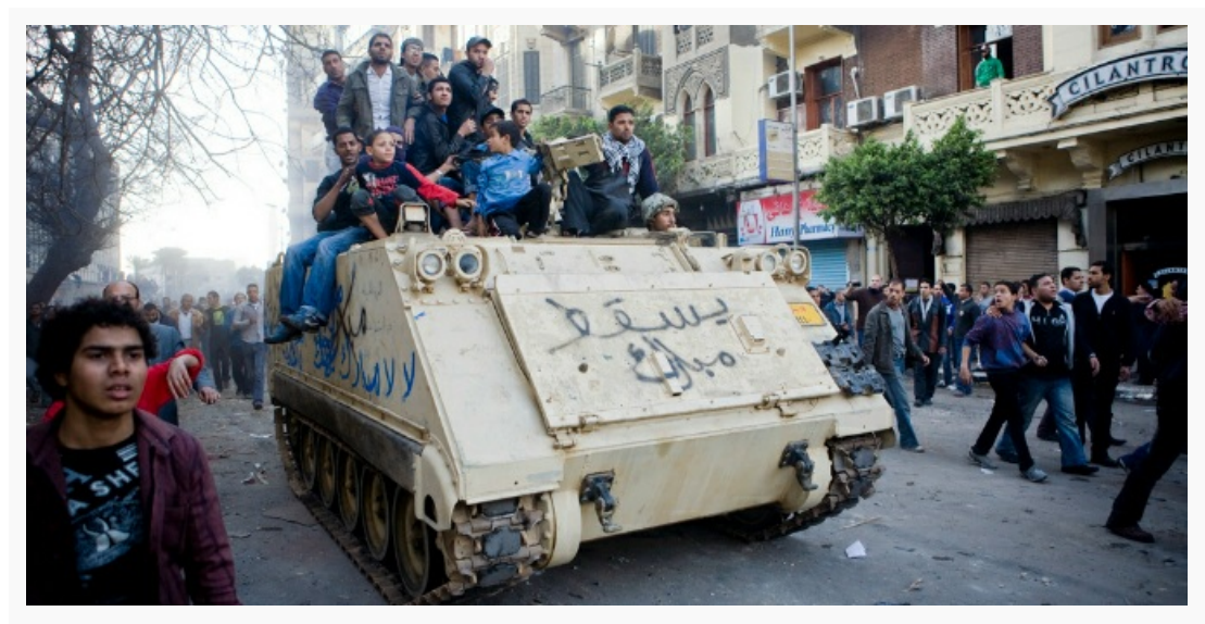
Lazoughli Square, near Tahrir Square, Egypt.

Heydarian talks warmly of the enthusiasm for the Islamic financial tradition among the new regimes (p. 125), and appears to see this as evidence of their rejection of capitalism, in line with his own view that the recent economic crash in the West prompted many of the Arab people to believe that US-style capitalism had failed. This is too uncritical a view of Islamic finance. It is true that at the rhetorical level it has benefited from widespread disillusionment with prevailing economic and banking models, but this does not mean that it can provide a real alternative to them in the long term, even if other important vested interests in the region would allow it to try, and, furthermore, most of its practitioners would reject the idea that it is anti-capitalist.