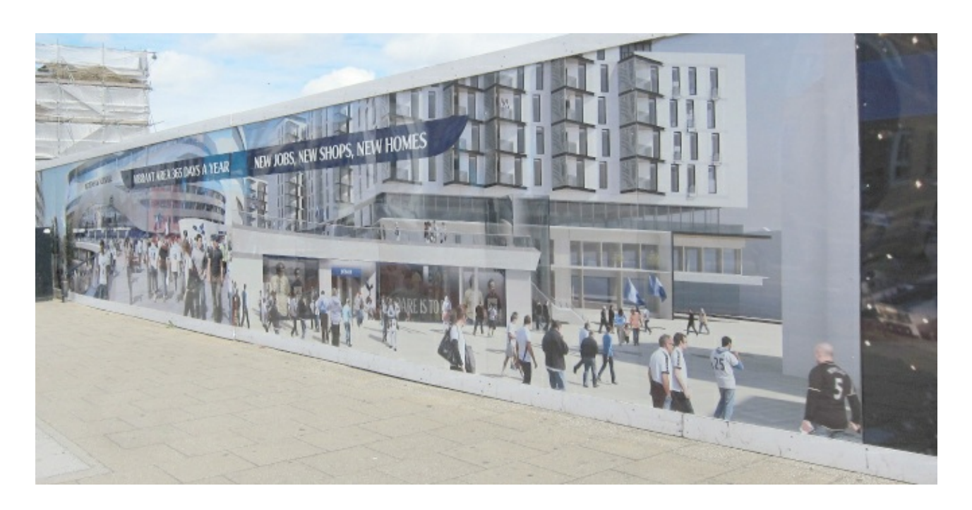
New Jobs, New Shops, New Homes

But is it only the (ex-)industrial white working class who are becoming disengaged because of the growing inequalities that characterise the new global division of labour? Guy Standing's book, The Precariat , paints a picture of societies in which many groups are being moved towards the edge through various forms of marginalisation and increased insecurities. Those changes stimulate anger, anomie, anxiety and alienation – the potential foundations for what his subtitle dubs ' The New Dangerous Class '. The precariat is not yet a 'class-for-itself', collectively seeking freedom and basic security, but is instead a 'class-in-the-making […] increasingly able to identify what it wishes and what it wants to construct […] an ethos of social solidarity and universalism, values rejected by the utilitarians' (181) who have created the global liberal society. Too many people are denizens, not citizens, and in his chapter on 'A Politics of Paradise' Standing sets out what he considers is needed to change to make us all citizens.