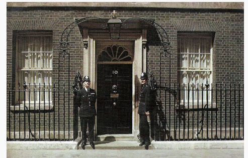
10 Downing Street

In choosing who to move, and who to keep, a Prime Minister has a number of considerations weighing against one another; be they based on ideological or other reasons. Impressive junior Ministers and Parliamentary Private Secretaries may have earned a promotion, while older Cabinet Ministers may be reaching the end of their political life. Meanwhile, younger backbenchers may be seen to have earned an opportunity at high office. All of this creates substantial pressure for Cabinet personnel change.