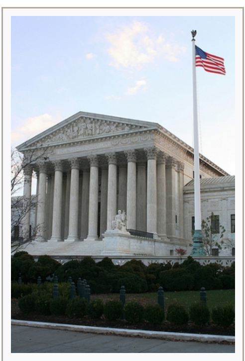
U.S. Supreme Court