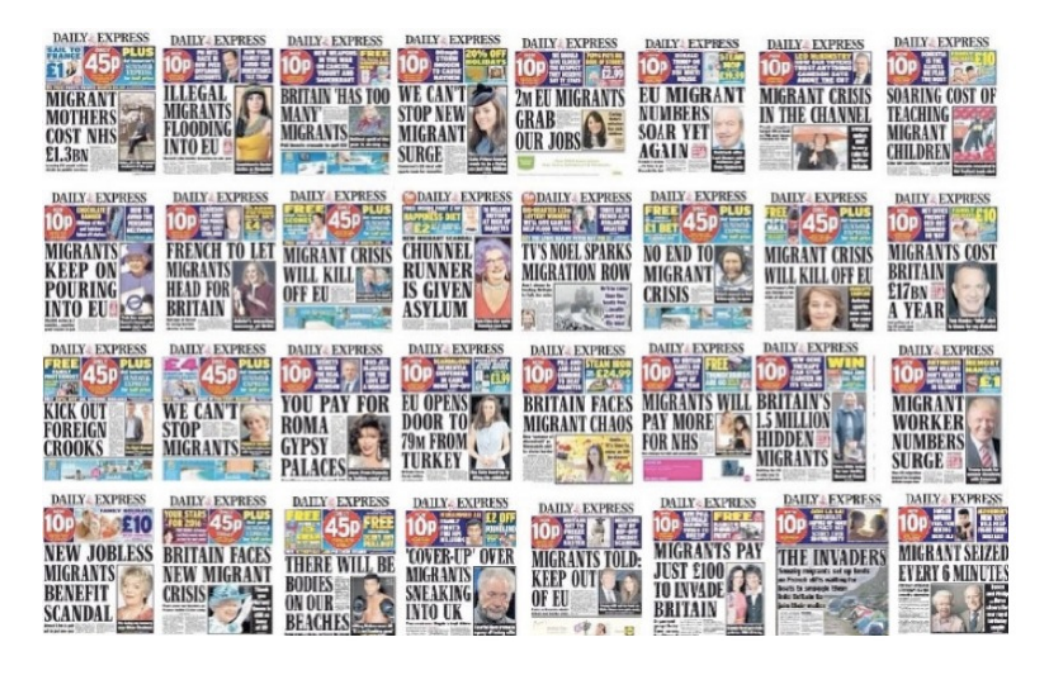
Figure 2: Headlines about immigration in a UK tabloid newspaper

Race-related hate crime rose 37 per cent in England and Wales between 2011/12 and 2015/16, while hate crime based on religion rose 172 per cent in the same period. At the same time, the Equality and Human Rights Commission has noted increasing incidents of hate crimes, with racial, Islamaphobic or anti-Semitic motivations in England. This contrasts with Scotland, where there was a significant drop in charges reported with 'a religious aggregation' in 2014-15. (The incidents of religious abuse that did take place there were predominantly aimed at Catholics and Protestants). Police noted a peak in race and religious hate crimes after the murder of soldier Lee Rigby and a rise in hate crime after the Charlie Hebdo terrorist attack in Paris. So policy debates around ethnic inequalities and religion and belief are taking place against a highly charged atmosphere, raising new challenges for the UK's traditionally low-key ways of handling these issues.